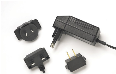
Worldwide compatible AC adapter/charger (SNT-121A)

Three lasers with built-in optical isolators are combined to the angled optical output (APC), providing easy return loss measurements without the need of external normalization. High-precision fiber couplers and an auto-zeroing function (patent pending) guarantee outstanding measurement accuracy.