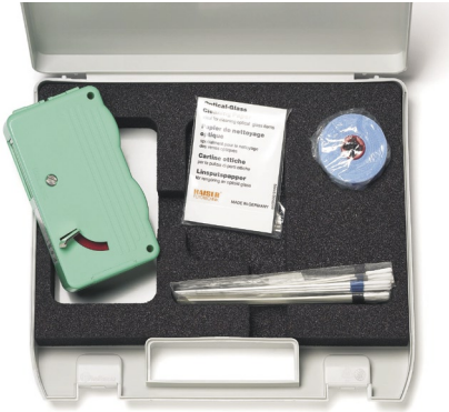
OCK-10 Optical Connector Cleaning Kit