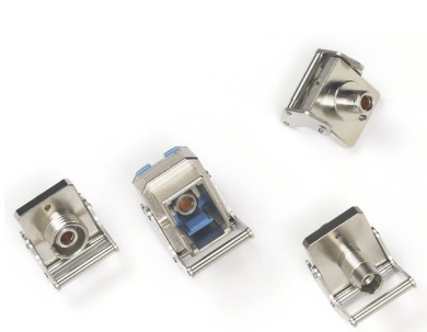
Optical adapters (BN 2150) for laser source output